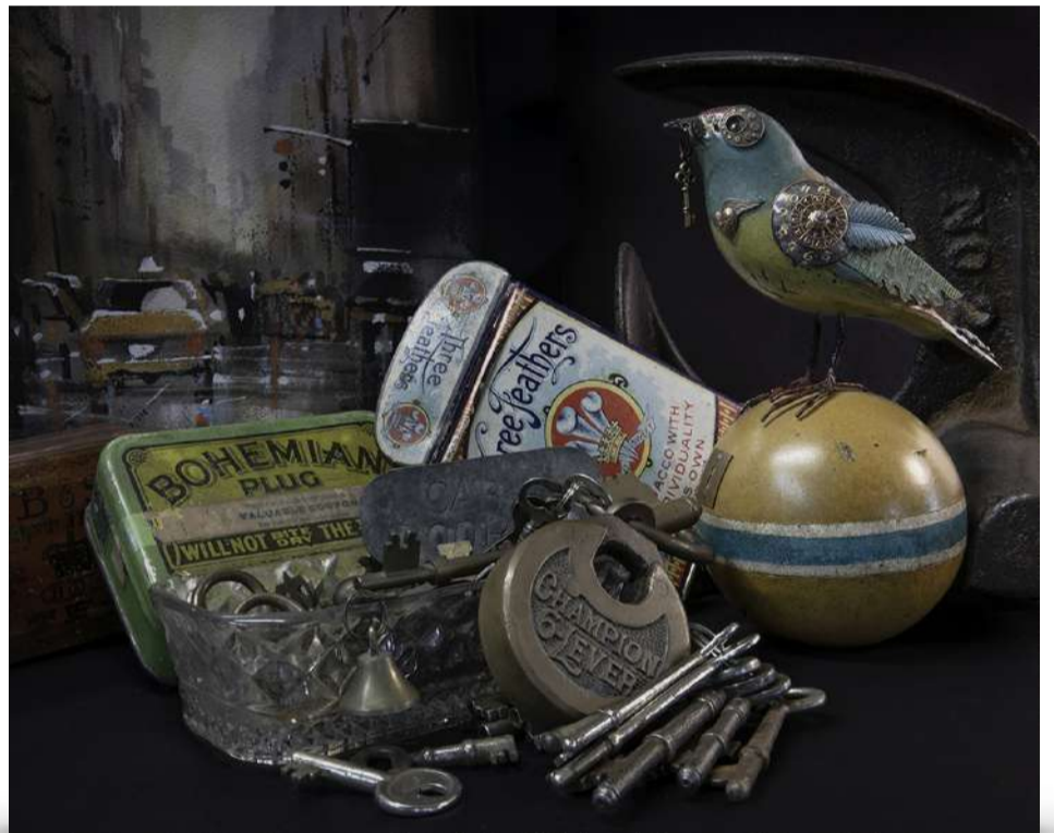
07-Objects de Art II.jpg, Charlie Gibson