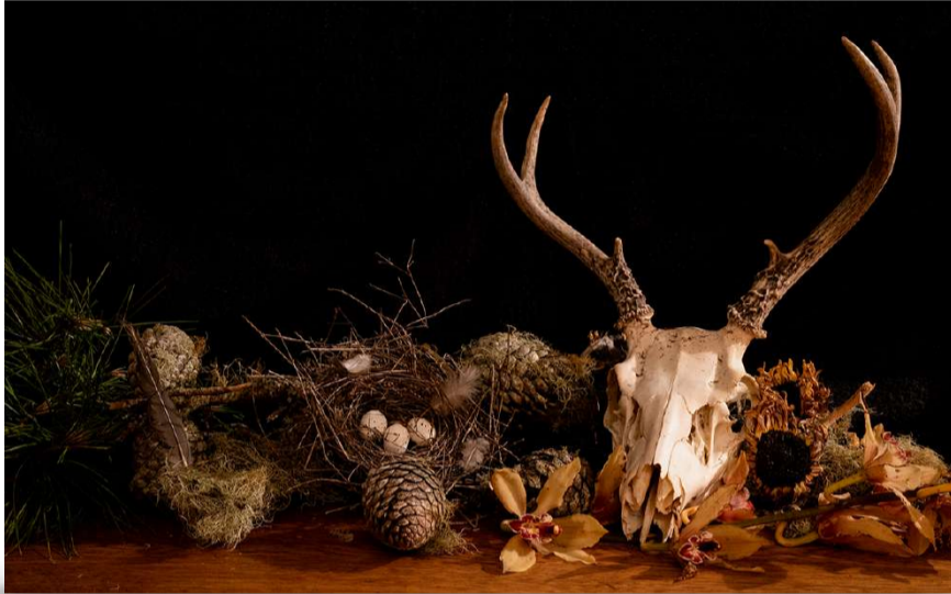
01-Carmel Garden Still Life.jpg, Karen Schofield STAR RATING:5 COMMENT: Good use of color palette. Excellent composition