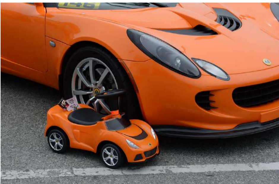
06-Lotus Elise Models for Parent and Child.jpg, Don Eastman STAR RATING: 3 COMMENT: Fun image to look at.