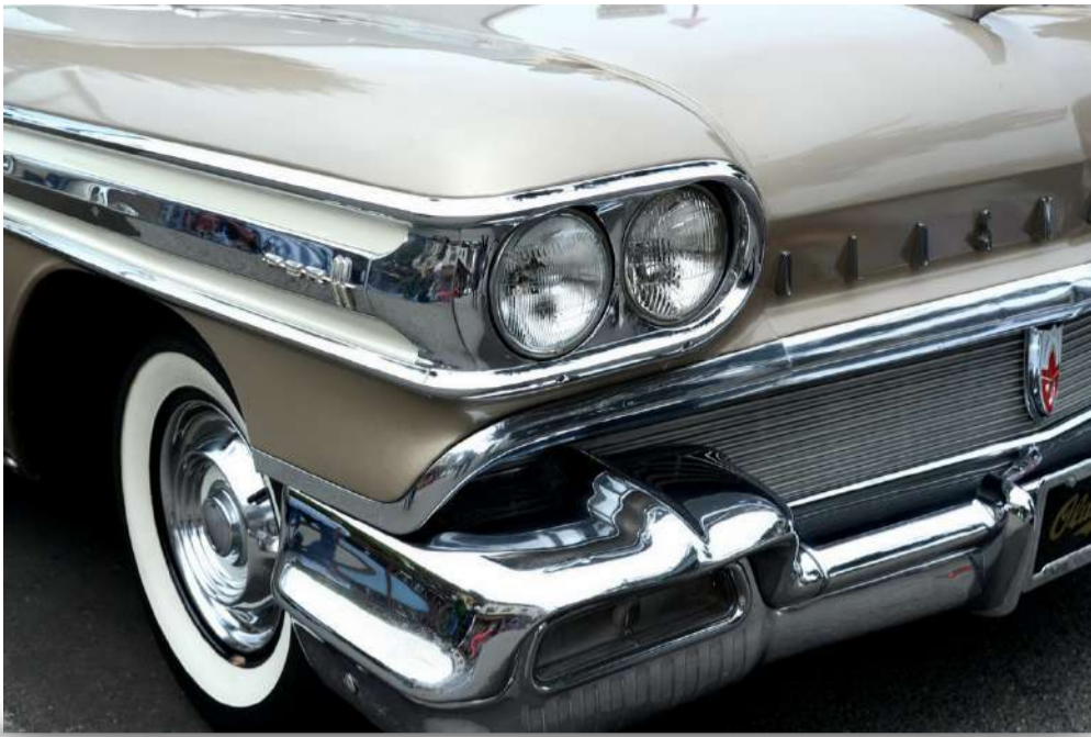
04-GM's Excessive Chrome Year on 1958 Oldsmobile.jpg, Don Eastman STAR RATING: 3 COMMENT: Strong image but lacks interest. An even tighter crop would make it more interesting.