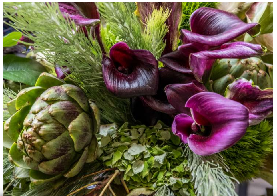
08-Purple Calla Lily Centerpiece from Castroville.jpg, Dick Light