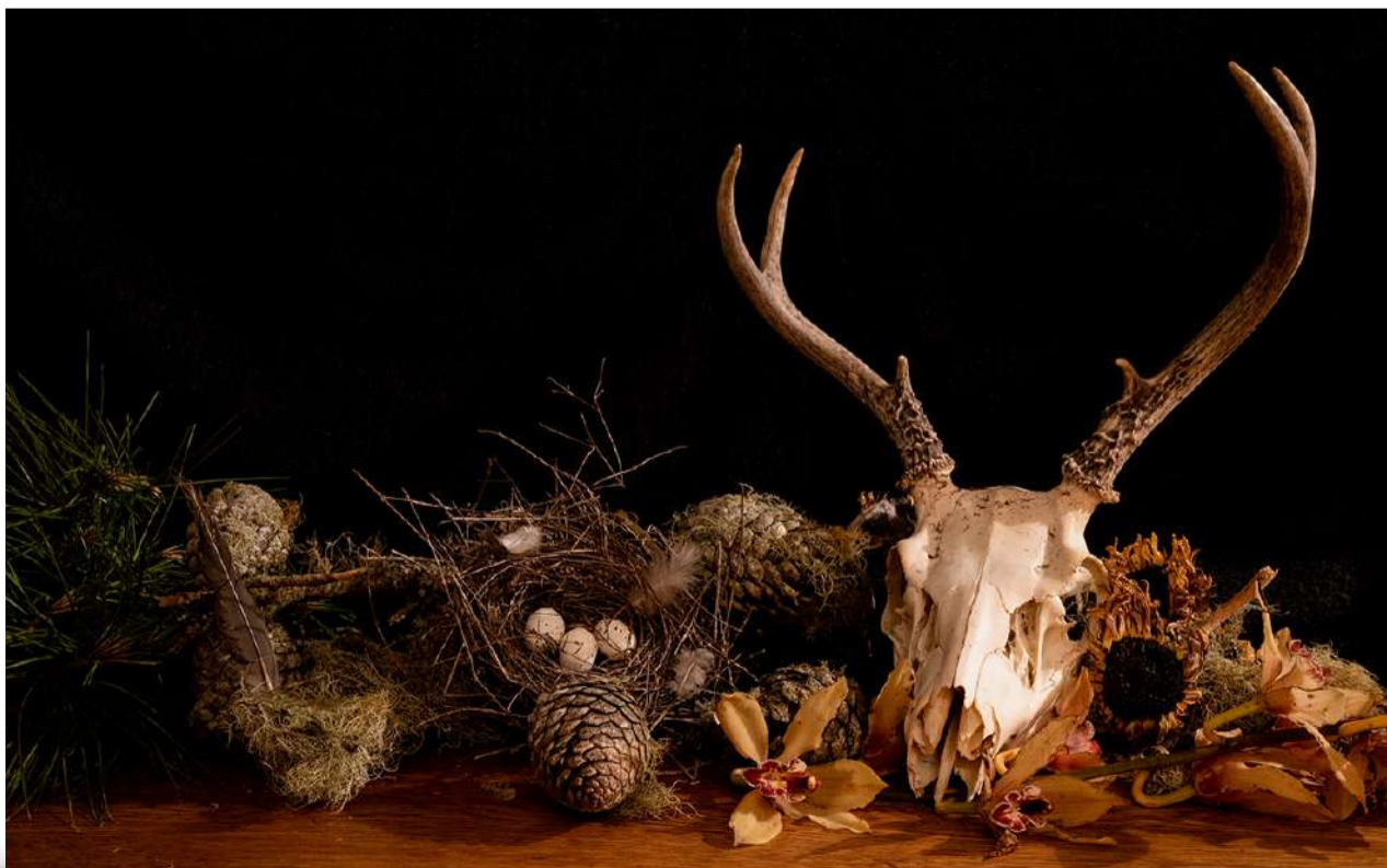
01-Carmel Garden Still Life.jpg, Karen Schofield