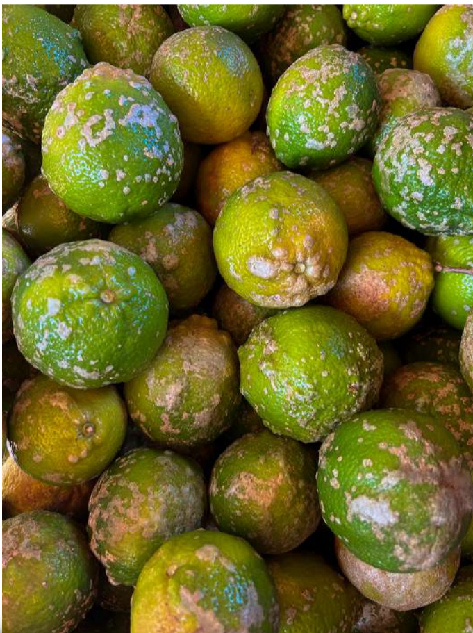
05-Limon Mandarina.jpg, Karen Schofield STAR RATING: 3 COMMENT: Nice use of color and texture; very sharp. Image lacks focal point.