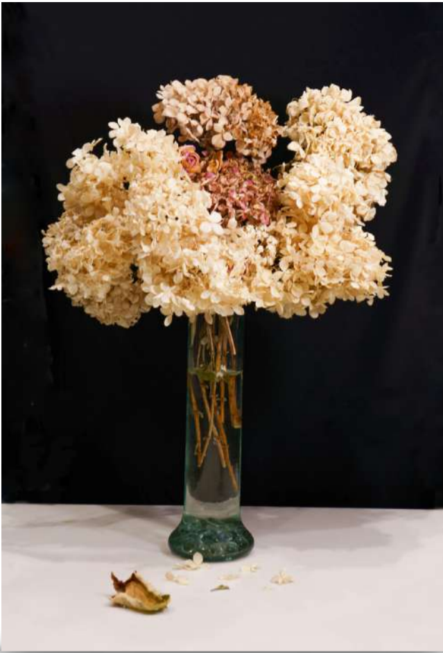
10-Yesterday's Bloom.jpg, Carole Gan STAR RATING: 5 COMMENT: Excellent composition; perfect cropping; image captures attention.