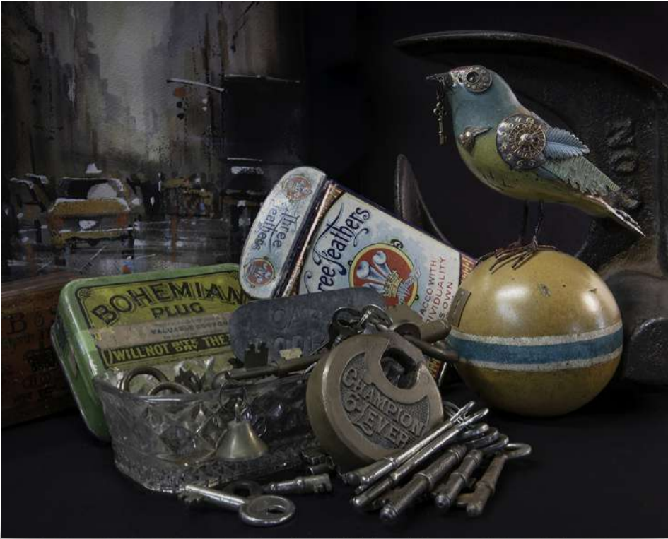
07-Objects de Art II.jpg, Charlie Gibson STAR RATING: 5 COMMENT: Interesting, well put together still life.