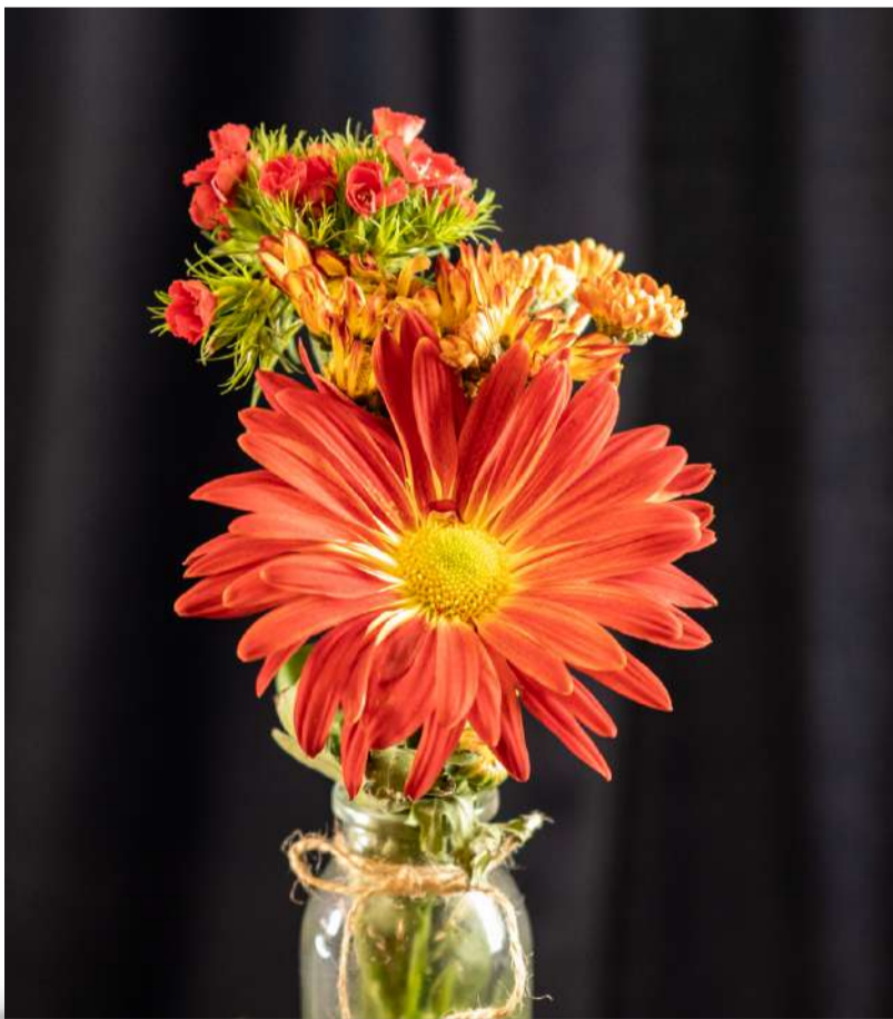
03-Gerberra and Friends.jpg, Dick Light