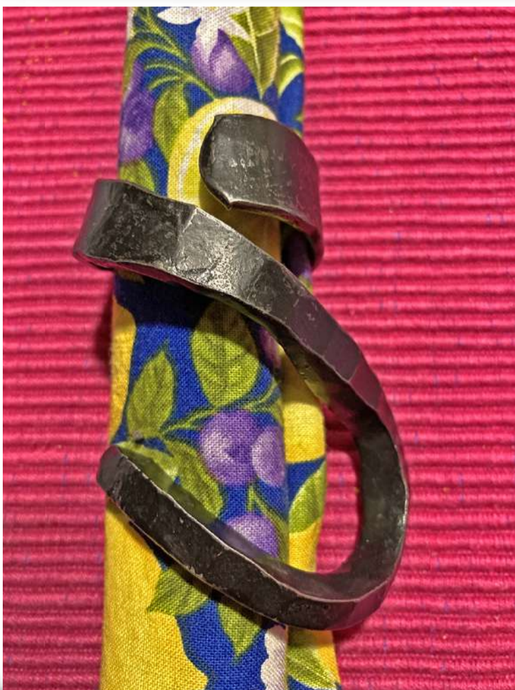
09-Wrought Iron.jpg, Brooks Leffler STAR RATING: 2 COMMENT: Good use of colors--overall image lacks interest.