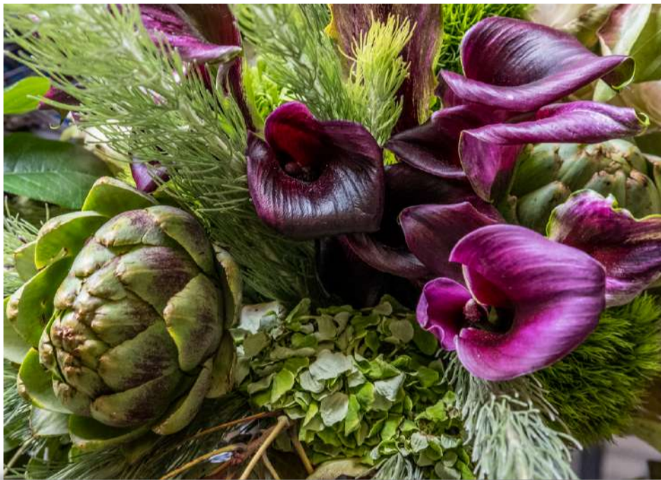
08-Purple Calla Lily Centerpiece from Castroville.jpg, Dick Light STAR RATING: 4 COMMENT: Well balanced; good use of colors.